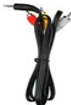
4.Cigarette Charger (3M)