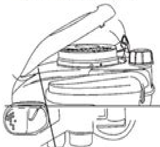
ENGINE MODEL NUMBER LOCATED UNDER COVER