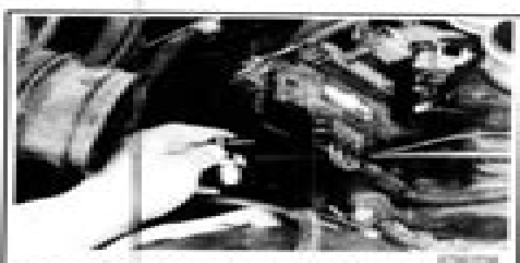
Fig. 45 Disconnect the PCV valve from the hose and remove the valve from the vehicle