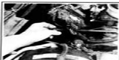
Fig. 44 Pull the PCV valve out of the cylinder head