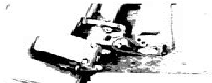
1. Set position