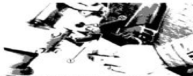
1. Shallow water drive lever 2. Stopper