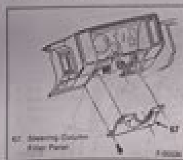
Figure 4-Steering Column Filter Panel