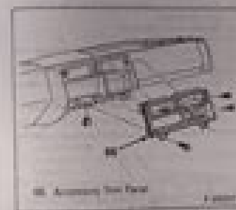
Figure 7-Accessory Trim Panel