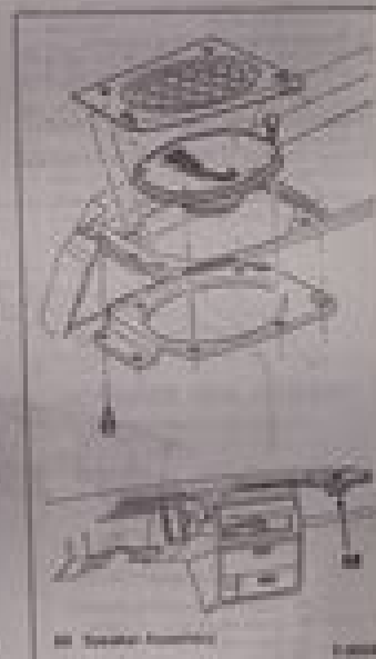
Figure 8-Radio Assembly