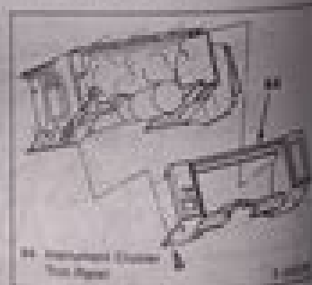
Figure 5-Instrument Cluster Trim Panel