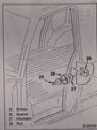
Figure 7—Window Rail Components

Push from the window side the top of the door to the other side of the window. This is to move the window to position when the regulator is removed.