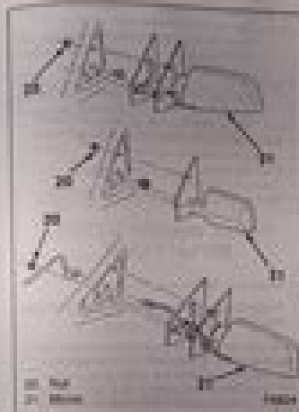
Figure 6—Window Rail View