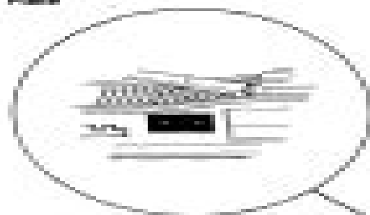
Vehicle Identification Number Plate