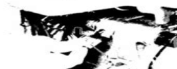
1. Tilt lever