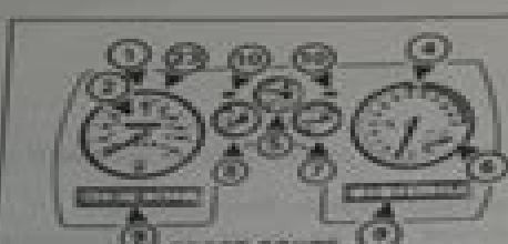
SPORT COUPE, IRC Z WITH V8 (CODE E) ENGINE