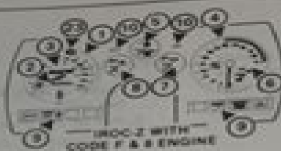
IRC Z WITH CODE F & B ENGINE