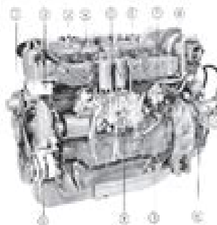
Fig. 4 Engine TAMD60

The fuel system is well protected from interruptions during running by means of an electrically operated fuel filter. On the TAMD60 engines the fuel injection pump is large mounted under the other engine from the pump filter in a bracket.