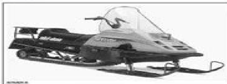
TYPICAL — TUNDRA R

Skandic LT Skandic LT E Skandic WT Skandic SWT Skandic WT LC Skandic SUV