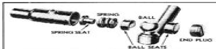
Fig. 3—Front Axle Tie Rod

Two types of tie rod ends are used. Figure 3 illustrates the adjustable type used on all \frac{1}{2} and \frac{3}{4} ton except the \frac{3}{4} ton Forward Control. The