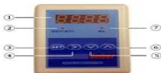
Figure 1. Front panel