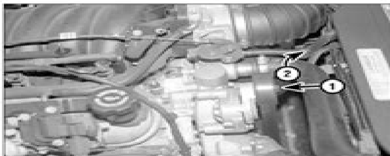
24.11 To remove the drivebelt, rotate the tensioner bolt (1), clockwise (2) to relieve belt tension (2007)