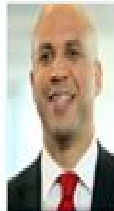
Booker • Nay •