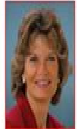
Murkowski • Yea •