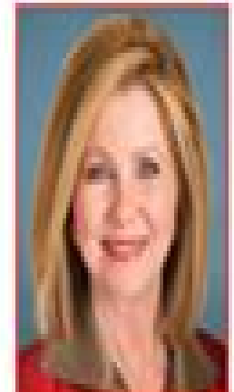
Blackburn • Yea •