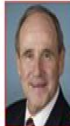
Risch • Yea •