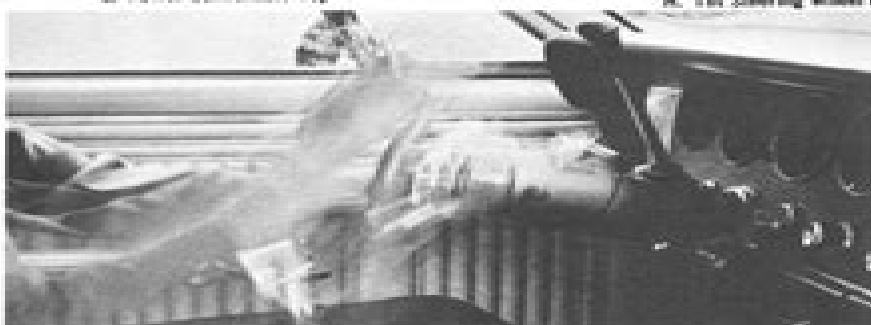
H. Tilt Steering Wheel •