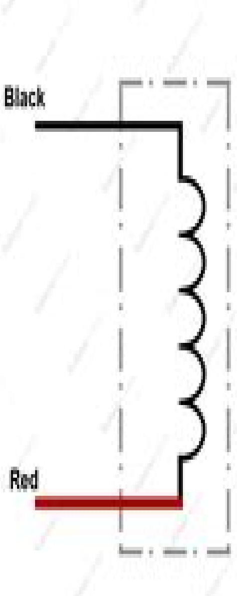
1-Phase 2 Wire Motor Winding