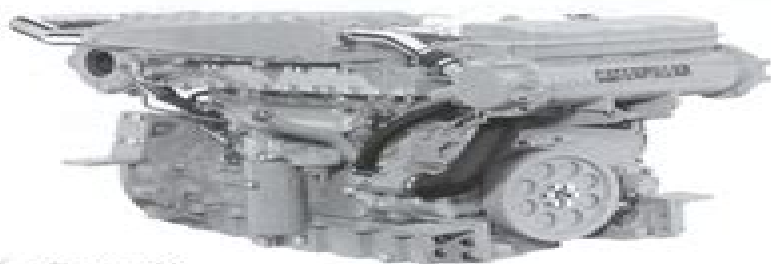
Shown with Accessory Equipment