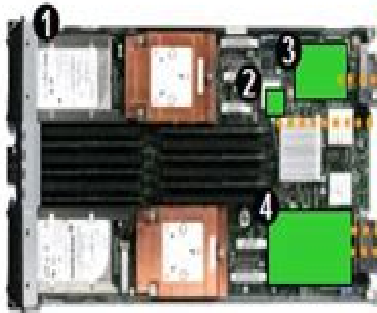
IBM BladeCenter server