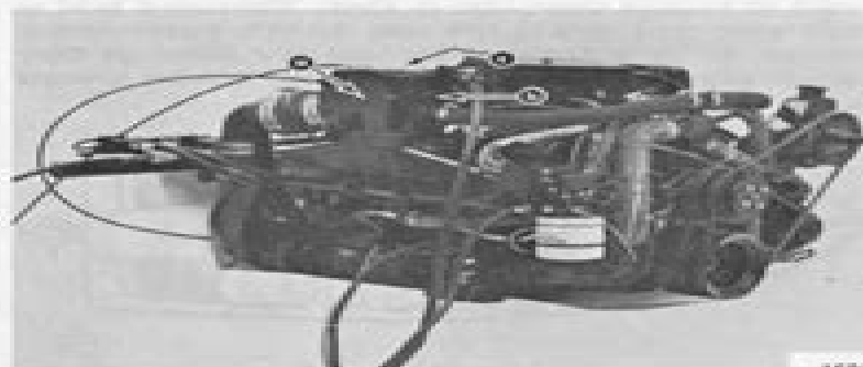
a - Exhaust Elbow Mounted in Center of Manifold b - Shift Plate On Side of Exhaust Elbow c - Thunderbolt IV (HEI) Ignition System

MCM 200, 230, 260, 300 Tempest Alpha One, 350 Magnum, 454 Magnum, 5.0 Litre, 5.0 Litre LX, 5.7 Litre, 7.4 Litre