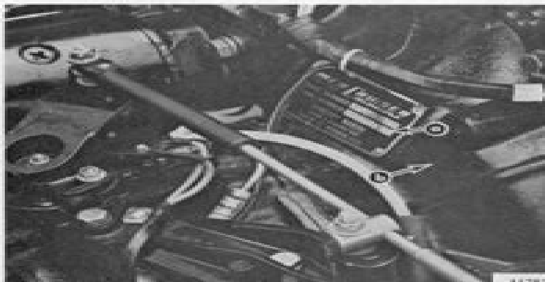
a - Serial Number Plate b - Flywheel Bell Housing

MCM 370 TRS (S.N. 6721527 and Below)/400 TRS/ 400 Cyclone/440 Cyclone/460 Cyclone/230 TR/260 TR