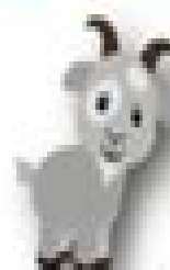
Little Billy Goat Gruff