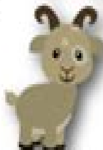
Middle-sized Billy Goat Gruff