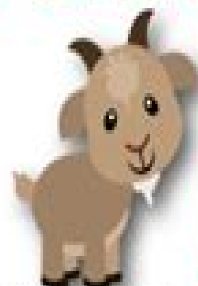
Big Billy Goat Gruff