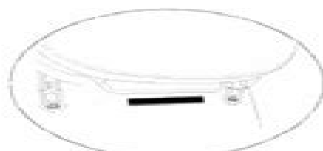
Vehicle identification number