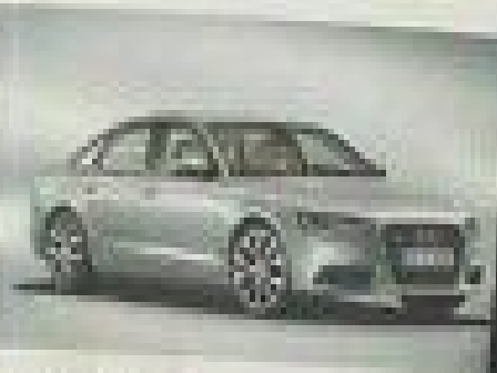
Audi A8 (D5) 4.0 TFSI quattro