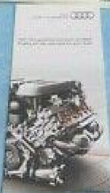
Audi A8 (D5) 4.0 TFSI quattro