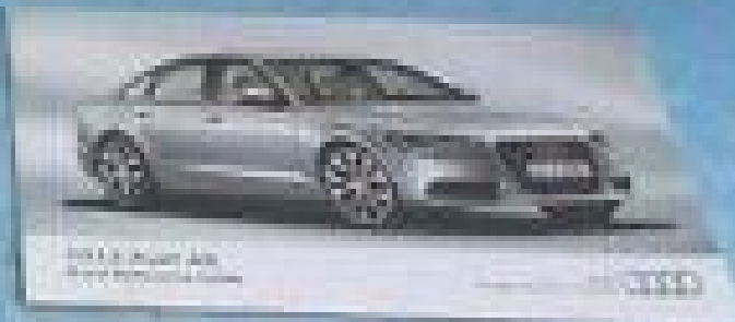
Audi A8 (D5) 4.0 TFSI quattro