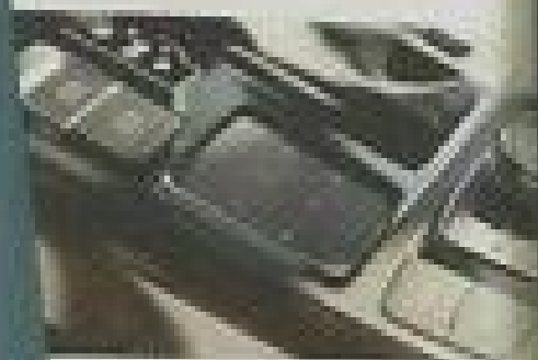
Audi A8 (D5) 4.0 TFSI quattro