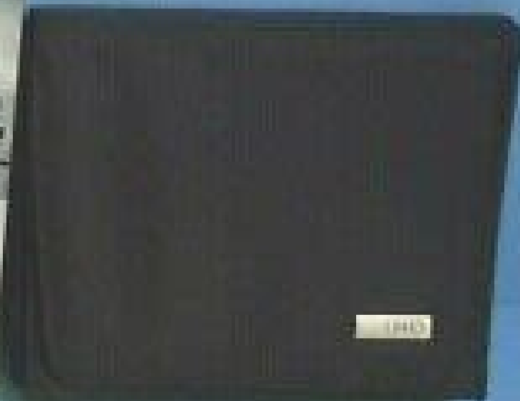
Audi A8 (D5) 4.0 TFSI quattro