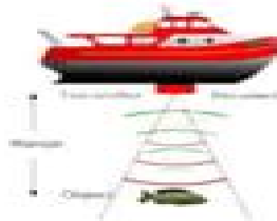
FIG. 13 Active sonar.