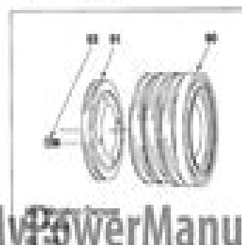
Figure 10. Composite of Figures 9 and 11.