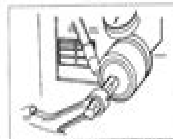
Figure 13: Finding the Corresponding Real Power for Real Power