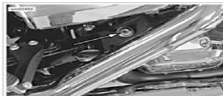
Figure 1-17. Transmission Filler Plug/Dipstick Location