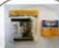
PUNCTURE REPAIR KITS REPLACEMENT STRINGS