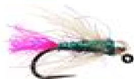
TUNGSTEN PINK TAG JIG SIZE #14 X 1 SIZE #16 X 1