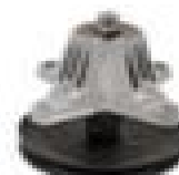
SPINDLE ASSEMBLY 618P09259