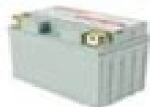
AGM BATTERY T25P17335

Refer to the parts list label under the lawn tractor's hood for original equipment parts.