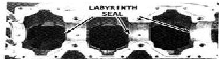
A 3-cylinder engine block with the labyrinth seals to hold pressure and vacuum within each cylinder.