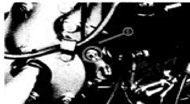
1. Knock sensor