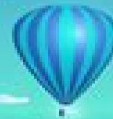
Hot Air Balloon