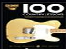
100 COUNTRY LESSONS (HL00696-453)