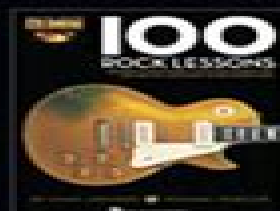
100 ROCK LESSONS (HL00696-453)