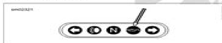
Figure 3-12. Oil Pressure Indicator Lamp

To troubleshoot the problem, always check the engine oil level first. If the oil level is OK, determine if oil returns to the oil pan. If oil does not return, shut off the engine until the problem is located and corrected.