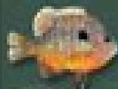
Bluegill Lepomis macrochirus

Beginning in the 1980s, there was a push to restore riparian zones. This was done by planting native plants and trees along the water's edge. These plants and trees help to stabilize the soil and prevent erosion. They also provide habitat for wildlife and improve water quality.