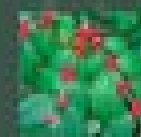
Japanese Knotweed Polygonum japonicum

A healthy ecosystem supports a full range of living organisms - plants, insects, birds, reptiles, amphibians and mammals. This balance is thrown off when non-native plants begin to colonize natural or artificially-managed areas by "crowding out" native species. As plant diversity is reduced, there are fewer wildlife species and the entire wetland chain starts to unravel.