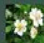
White-flowered Plant Asclepias tuberosa