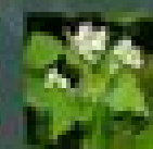
Tree-of-Heaven Ailanthus altissima