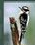
Downy Woodpecker Picopus pubescens