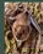
House Finch Carpodacus

It is important to remember that riparian zones are not just for the benefit of wildlife. They are also important for the benefit of humans. They provide a natural barrier between the land and the water, which helps to prevent erosion and flooding. They also provide a natural source of water for irrigation and other uses.