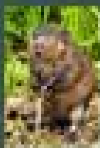
Skunk Mephitis mephitis