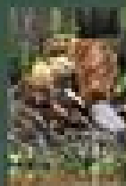
Raccoon Procyon lotor