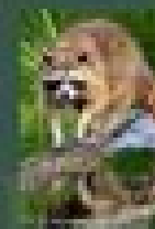
Muskrat Fiber zibetice