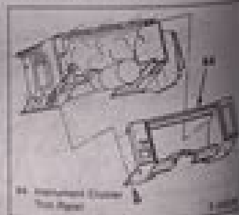
Figure 5-Instrument Cluster Trim Panel