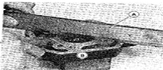
A. Straightedge B. Thickness Gauge