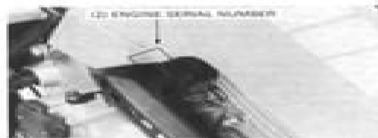
The engine serial number is stamped on the upper side of the right crankcase.