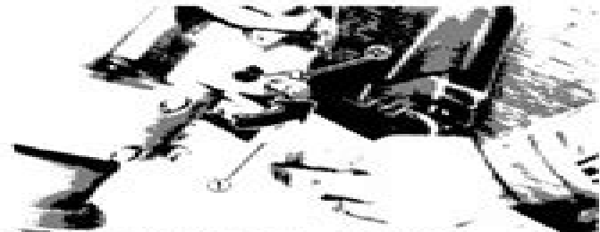
1. Shallow water drive lever