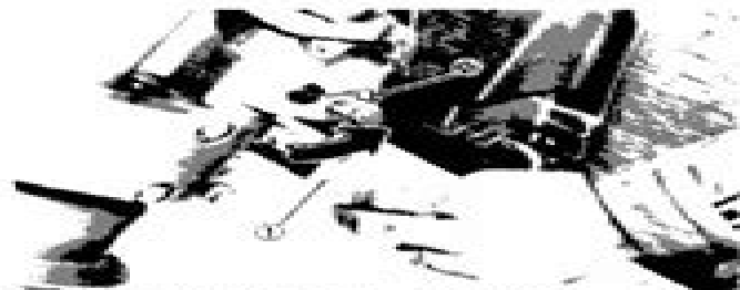
1. Shallow water drive lever 2. Stopper