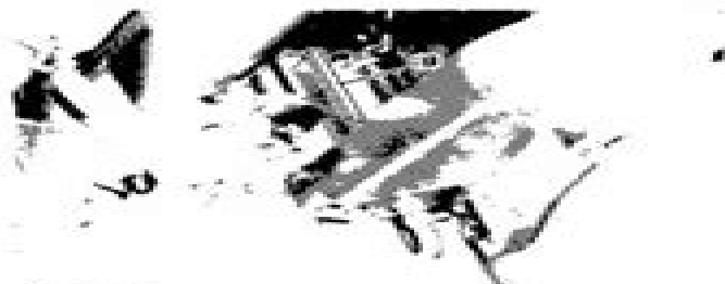
1. Tilt rod