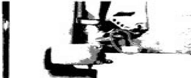
1. Normal position

This system allows cruising in shallows by inclining the outboard motor 20 degrees, although previously this was not possible.