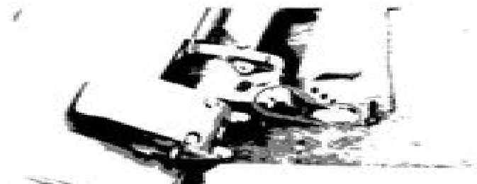
1. Set position