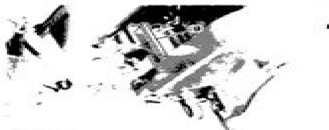
1. Tilt rod