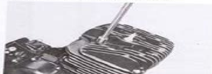
Fig. 9. Loosen cylinder head nuts sequentially, loosening each nut just a little at a time, and take off the head.