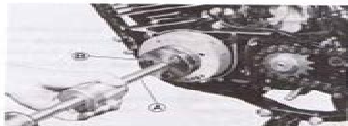
Fig. 6. Draw out the rotor by operating the special tools ② ③ (09930-30101) (09930-30150) as shown.