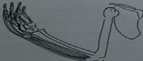
Extensor digitorum communis