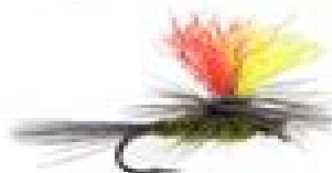
BWO PARACHUTE HI-VIS SIZE #16 X 1 SIZE #18 X 1