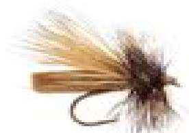
NEVER SINK CADDIS - TAN SIZE #14 X 1 SIZE #16 X 1