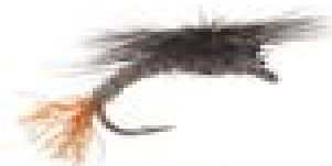
BWO FOAM EMERGER SIZE #18 X 1 SIZE #20 X 1