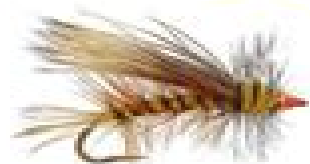
YELLOW STIMULATOR SIZE #10 X 1 SIZE #12 X 1