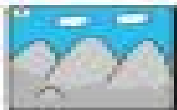
Mountainous Mountains Mountains are the 1 1. Mountains