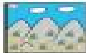
3. Mountains are the 1 3. Mountains are the 1 3. Mountains are the 1