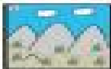
2. Mountains are the 1 2. Mountains are the 1 2. Mountains are the 1