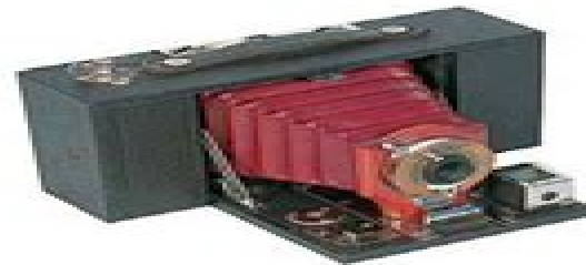
Folding-type Kodak No. 2 Brownie Model A camera, ca. 1904, $85.