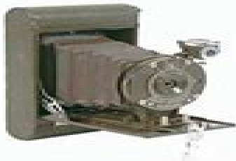
Kodak Boy Scout U.S.A. Model folding camera and case with Boy Scout logo, ca. 1930, $180.