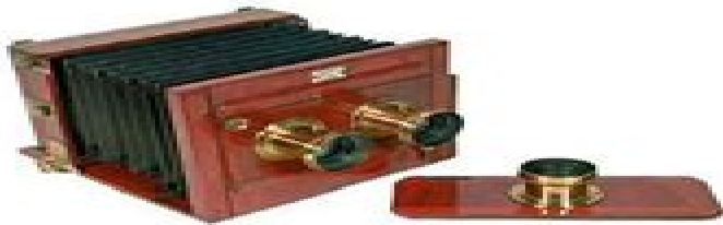
Stereoscopic field camera with additional lens board with lens for mono work, Scotland, ca. 1890s, $1,800.