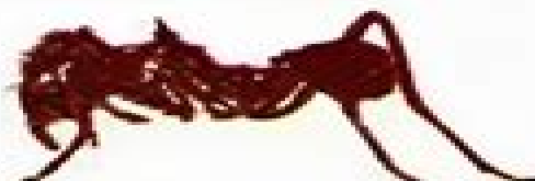
TEXAS LEAFCUTTING ANT