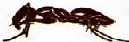
ODOROUS HOUSE ANT