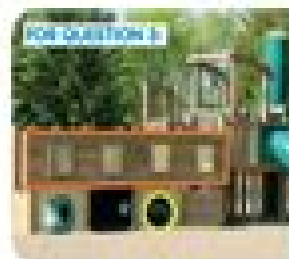
FOR QUESTION 4