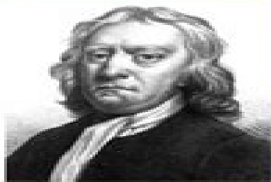
Sir Isaac Newton