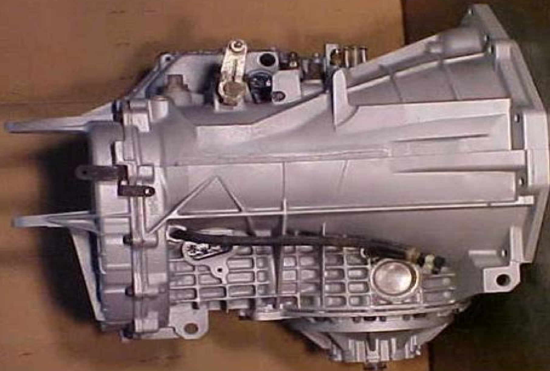
3.5L 42LE top view.